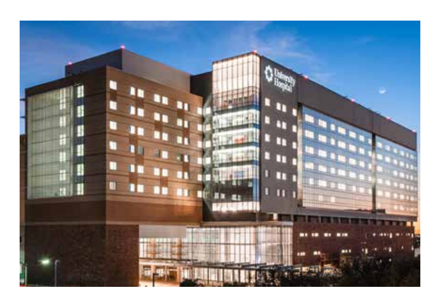
University Health System San Antonio Texas

University Health System is a nationally recognized teaching hospital and network of outpatient healthcare centers, owned by the people of Bexar County. In partnership with UT Medicine San Antonio, the practice plan of The University of Texas Health Science Center, it is consistently recognized as a leader in advanced treatment options, new technologies and clinical research